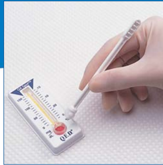
2. Insert collector.