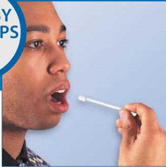
1. Swab mouth.